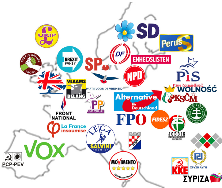
Figure 4.2: The recent proliferation of populist and/or anti-system parties in Europe

Orbán, has swung towards populism and economic nationalism since its return to government in 2010. A similar shift has taken place in the Polish Law and Justice (PiS) party, especially since 2015, and in Turkey, where the governing Justice and Development Party (AKP), under the stewardship of Recep Tayyip Erdoğan, has taken a path of economic and political nationalism and growing authoritarianism.